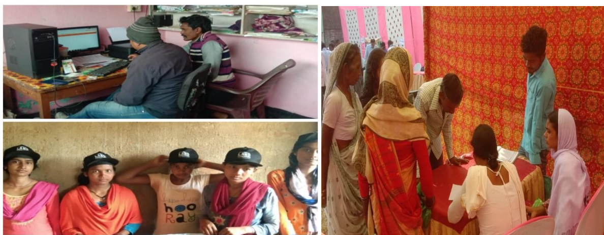
E-Women's Resource Centers

Two E-Women's Resource Centres have been established. Digital equipment procuring process is completed. These centres are functioning as Mahila Sansadhan Kendras (E-Women's Resource Centres). The centres play a crucial role in conducting village level meets to organise rural women and youth.