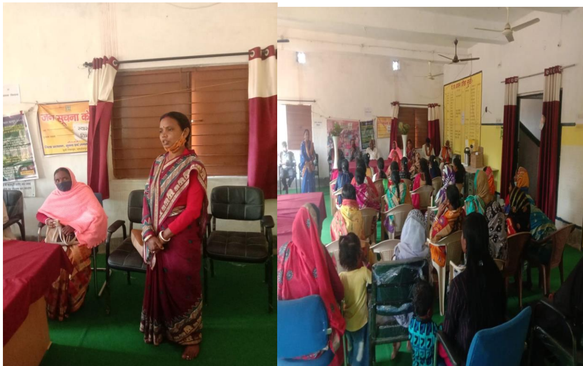
Public Meeting with Field-level Panchayat Leaders

Interactive session with Village Leaders and Government Officials: An interactive session with government officials and local body leaders was held on 19 th February 2022. Topic of discussion was “Empowerment of Women and Youth through accessing Government schemes”. Total number of participants was 75. Government officers and local body leaders spoke to the participants about different available government schemes and documents to needed to access those etc. Many participants voiced the problems they face.