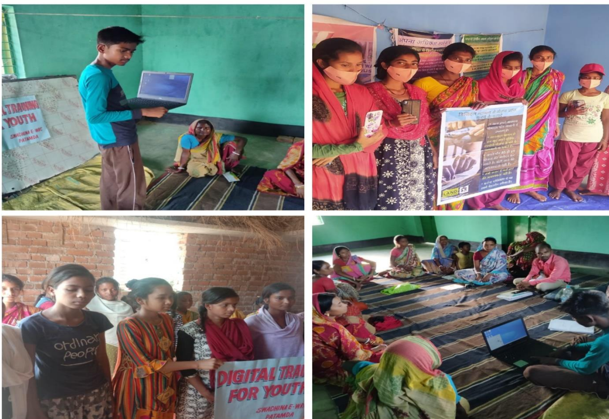
Glimpses from Digital Literacy Training

Digital Trainings: Series of digital trainings for youths are being conducted by Swadhina volunteers in small pockets for youth and young mothers. The participants learn about importance of digital literacy for self-development and submission of online application for government schemes. So far 120 youths have been covered under the program