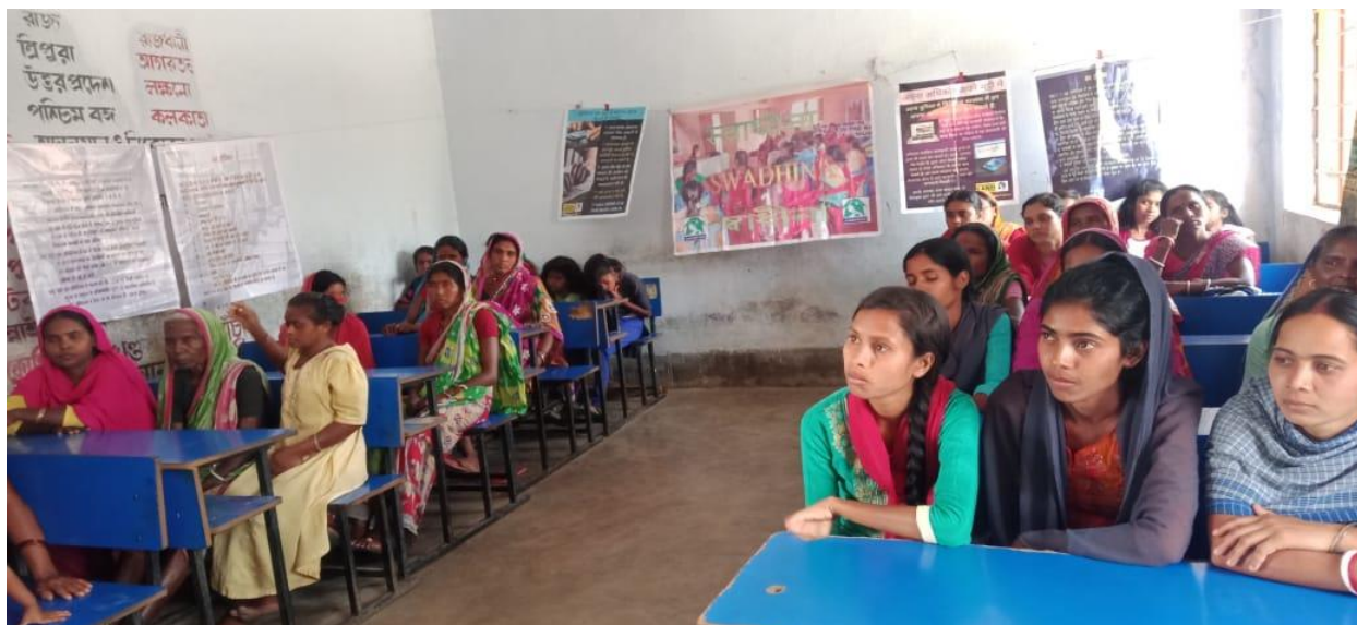
Interactive Meet on land of commons based livelihood

Interaction with Panchayat Leaders during Gram Sabha Meets: Swadhina lead members and WRC volunteers took part in village-level Panchayat meets to put forward issues on applications on access to Forest Land for the indigenous families in the region. The discussion with the local Panchayat leaders helped to put forward the needs to look into pending applications as a part of the resolution. Local government (Panchayat) leaders too promised to extend their whole-hearted support in this regard.