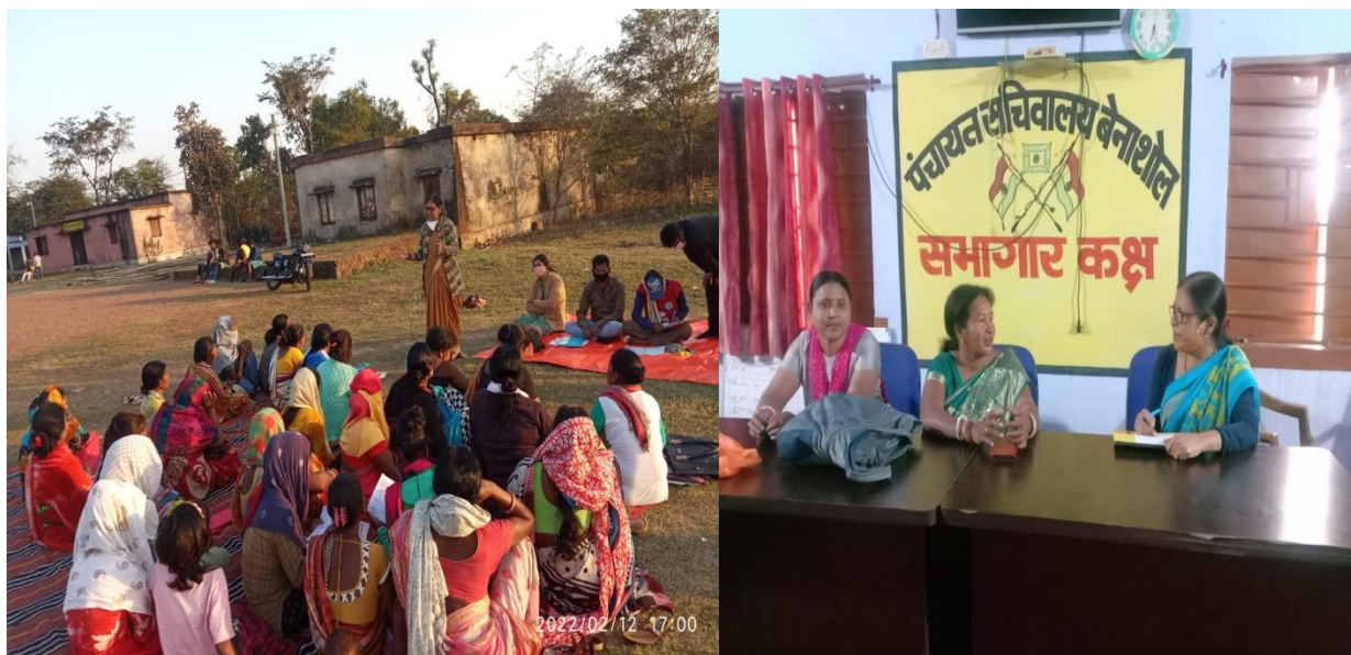
Interaction with various Panchayat Leaders

Interaction with Panchayat Leaders during Gram Sabha Meets: Swadhina lead members and WRC volunteers took part in village-level Panchayat meets to put forward issues on applications on access to Forest Land for the indigenous families in the region. The discussion with the local Panchayat leaders helped to put forward the needs to look into pending applications as a part of the resolution. Local government (Panchayat) leaders too promised to extend their whole-hearted support in this regard.